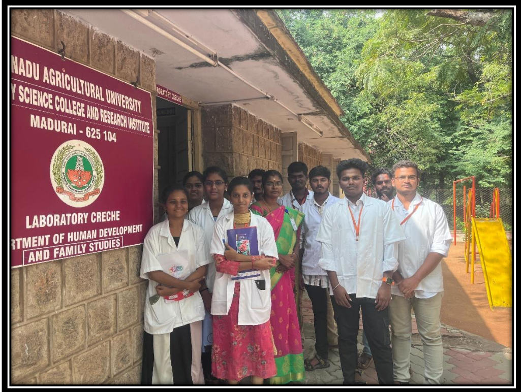
Students were visited the laboratory crèche